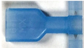
Current 16-14 AWG standard flare part (shown here with optional carrier strip attached)