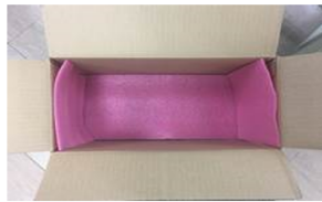
Before Used foams on the top and bottom of the carton, Tray thickness(mm):0.67