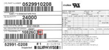
Carton label (sample image)