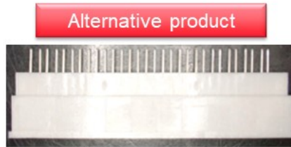
※ Reference : 30ckt