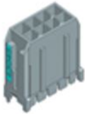
Series# 43045 8ckt