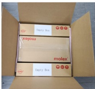
Box In Box