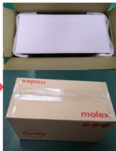
Single Box(with foam)