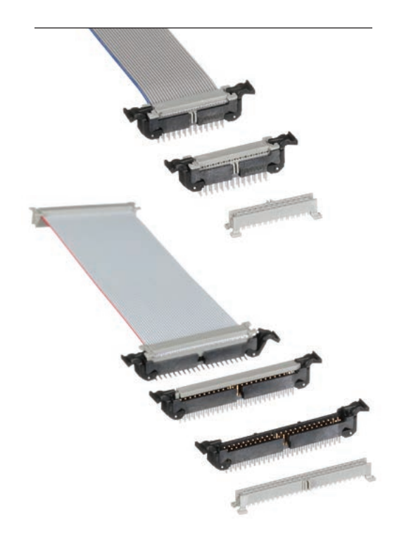
3M cable socket 451 and 3M header 452 series