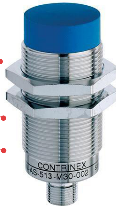
Full INOX inductive sensor