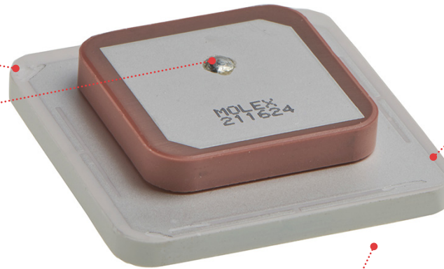
GPS L1/L5 & GLONASS 36mm Stacked Patch Single Feed Antenna (Series 211624)

Allows decimeter-level to sub-meter-level accuracies for geospatial data