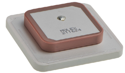
GPS L1/L5 & GLONASS 36mm Stacked Patch Single Feed Antenna (Series 211624)

Delivers high-gain, high-radiation efficiency performance for the most demanding GPS applications